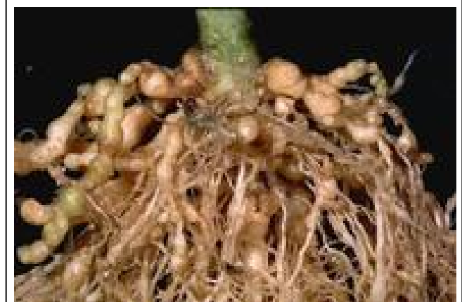
Galling on tomato roots caused by Root Knot Nematode.