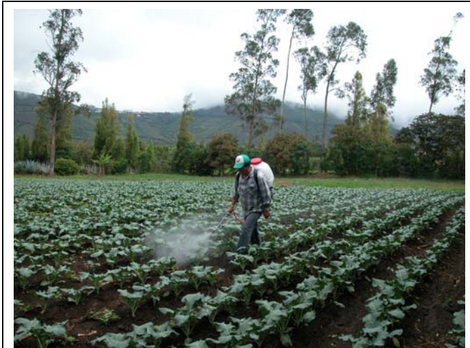
Spraying of a broccoli field for insect pests.