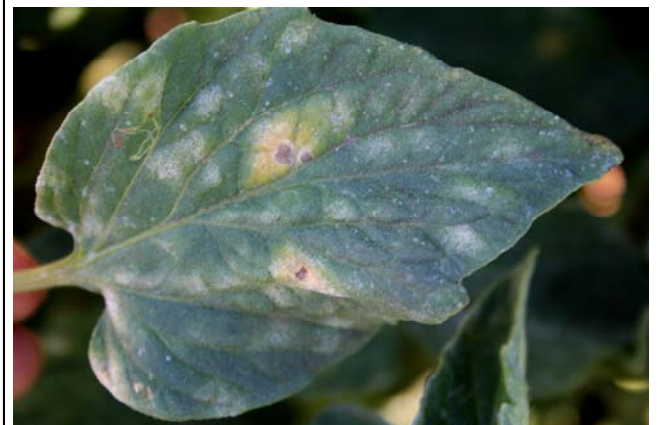
Powdery mildew sporulating on the top surface of a tomato leaf.