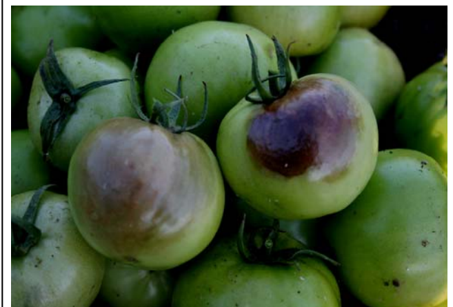
Late blight on immature fresh market fruit.